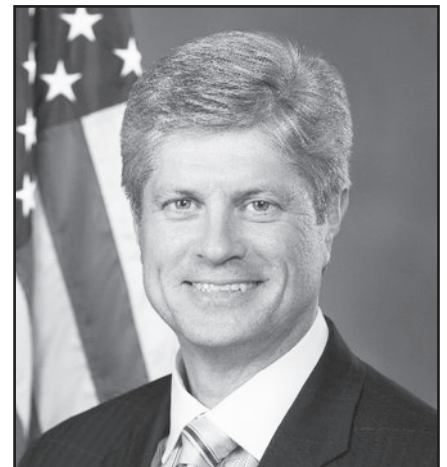
Congressman Jeff Fortenberry

Group to address these concerns. As a launching point for further engagement, I recently led a discussion with nuclear experts from the Bush, Obama, and Trump administrations, senior government officials, and retired military officers with experience in nuclear policy in complex organizations. In frank talk, we explored how to better address to-