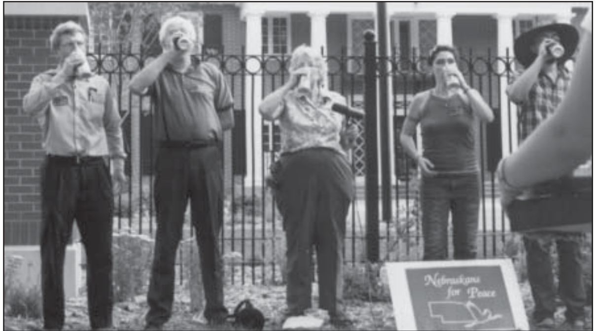
The seven Nebraskans for Peace who drank beer on the lawn of the Governor's Mansion June 10 pleaded "not guilty" in Lancaster County Court and will go to trial in early September for this misdemeanor offense.

The question my act of civil disobedience asks is: How is it that actions illegal in the state of Nebraska are cited in Lincoln but are not cited in Whiteclay? It is appropriate for me, a citizen of the state of Nebraska, to ask this question and I have asked it in the most effective way I know.